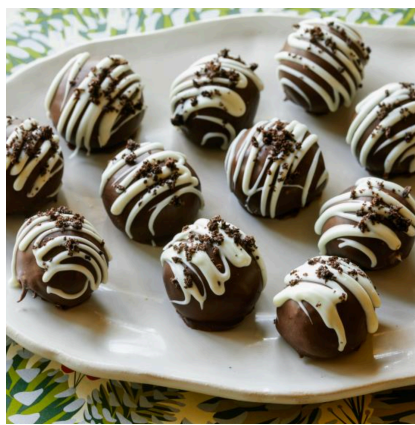
Oreo Balls (Food Network)