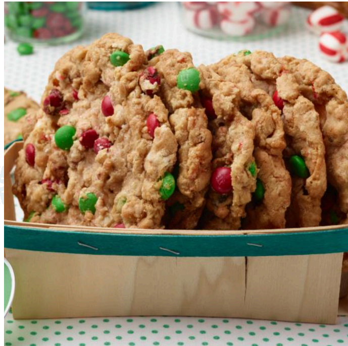
Holiday Monster Cookies (Food Network)