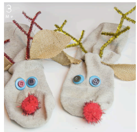
Reindeer Sock Puppets (Kids Craft Room)