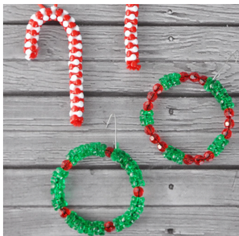
Bead and Pipe Cleaner Ornaments (Vicky Barone)