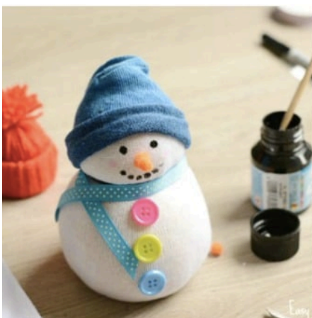
Sock Snowman (Easy, Peasy and Fun)