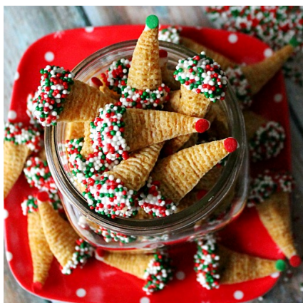
Elf Shoes (Life with the crust cut off)