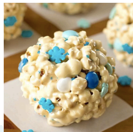
Frozen Popcorn Snowballs (Life Made Simple)