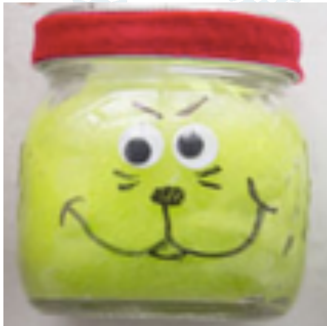
Christmas Slime (The Best Ideas for Kids)