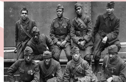
Harlem Hell Fighters