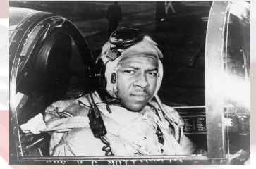
Jesse L. Brown

When North Korea invaded South Korea, the United States came to aid South Korea while China and the Soviet Union assisted North Korea. During this war, Jesse L. Brown became the U.S. Navy's first black aviator in October 1948. Unable to escape from his plane upon crashing, he died during the Battle of Chosin Reservoir in North Korea.